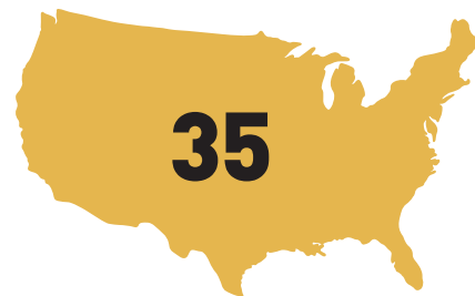
States and U.S. territories